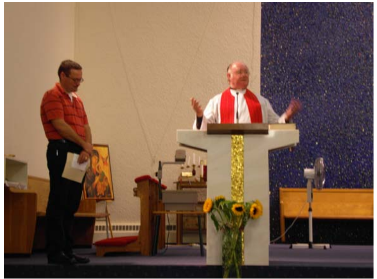
Preparing to make the commitment to Cursillo as Prime Apostolate.